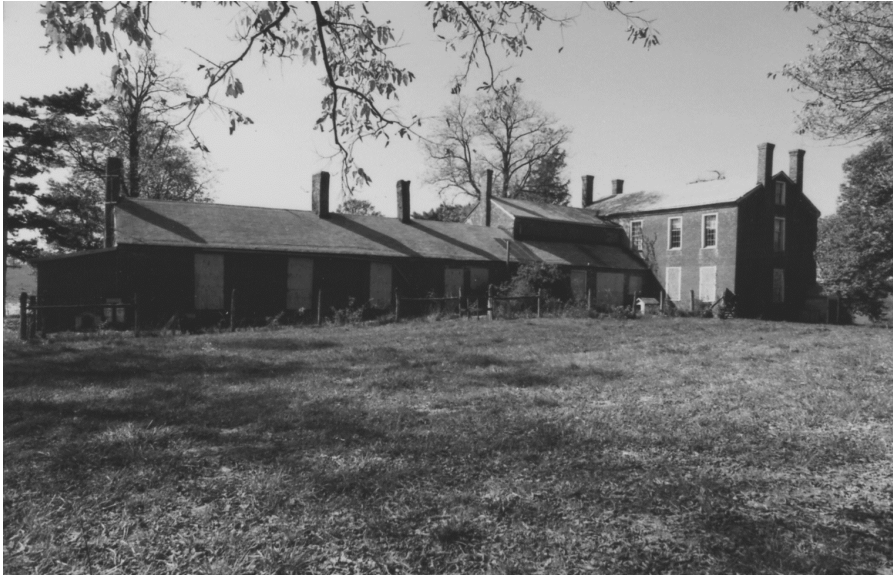
Historic Griffith Tavern was built by William Griffith in 1827. The Friends of Griffith Woods must raise $190,000 to begin to stabilize the foundation and exterior walls. View from the rear showing the ell.

The Friends of Griffith Woods is a non-profit group whose goals are to : - Facilitate preservation, restoration, and public use of the unique ecological, cultural, archaeological, and structural features of Griffith Woods, including ownership and operation of rehabilitated historic structures on the site